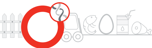
Table 1 – Summary of offences where Infringement Notices can be issued